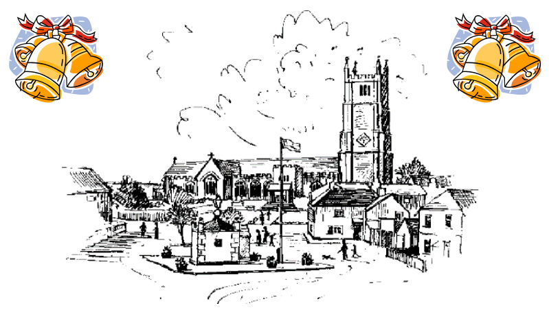
Services at St. Peter's Church, Ugborough

Services start at 9.30 a.m. unless otherwise shown.